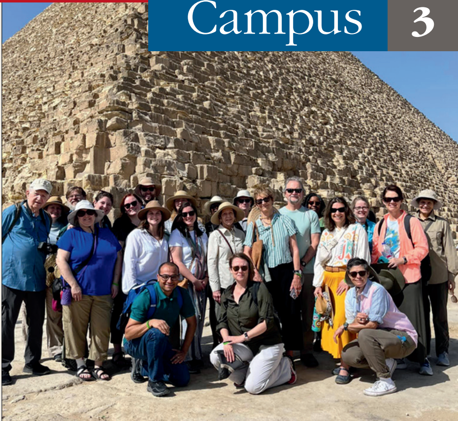
Travel Seminar group in the Middle East